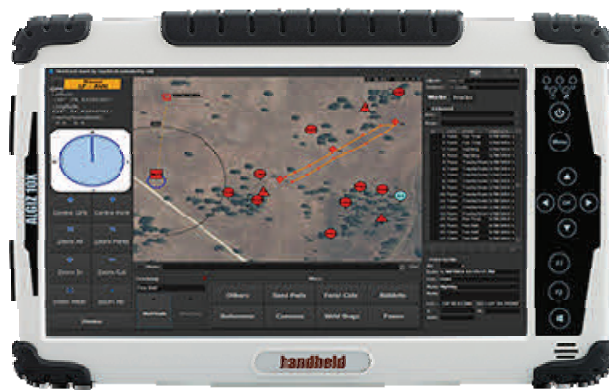
Handheld Algiz 10X

AssetTrack enables mapping, recording and monitoring of project data in the field. It is customisable to suit many types of projects. These include revegetation and rehabilitation projects, vertebrate pest surveys and control, remote equipment maintenance, earthwork projects, mine surveying and bush fire control.